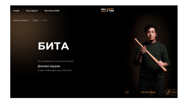
Figure 24. The Matter Is 2.0' information campaign

Implementation of The Matter Is 2.0' information campaign, a social initiative campaign initiated in 2020 by the Ministry of Internal Affairs with the support from the Office of the Vice Prime Minister for European and Euro-Atlantic Integration, the First Lady of Ukraine and international partners, continued in 2021. It included an exhibition and an online video campaign presenting