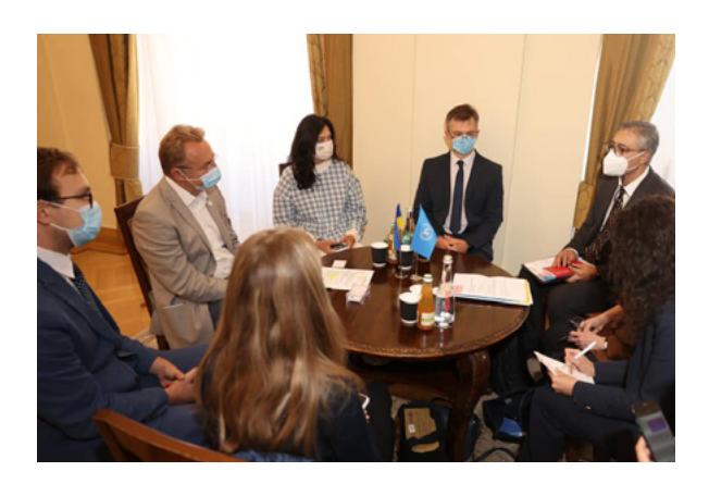
Figure 22. UN Resident Coordinator and UNICEF Resident Representative at the meeting with Lviv city mayor during the joint mission

The UNCT enjoyed improved access and partnership with the Government and strategic engagement with international partners facilitated by the RC. Courtesy call meetings were initiated and organized by the RC, and were held jointly between UNCT members, ministers and government representatives, representatives of the development cooperation community, and other partners to discuss cooperation opportunities and build partnership. In addition to bi-weekly UNCT meetings, ad hoc and thematically focused meetings were initiated and organized by the RC, including visits with United Nations agencies' officials and external guest speakers, etc.