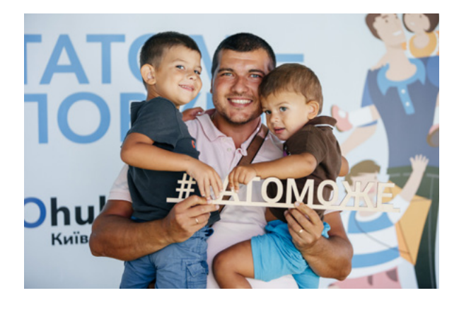
Figure 16. Tatohubs in Kramators and Odesa successfully generated political support to ensure sustainability of men's engagement initiatives

With respect to institutionalization, tatohubs in Kramators and Odesa successfully generated political support to ensure sustainability of men's engagement