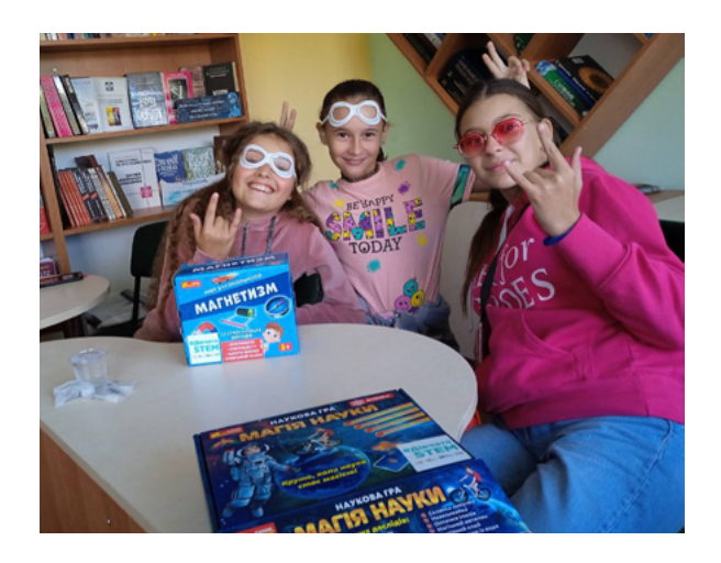
Figure 11. The United Nations continued its long-standing effort to promote gender equality in STEM professions

Aligned with the recently approved National Strategy for the Development of Science, Technology, Engineering and Mathematics (STEM) Education, the United Nations continued its long-standing effort to promote gender equality in the STEM professions, ensuring career choices free from discrimination and advancing more equitable conditions for women and girls in the technology sector. The national survey on stereotypes in career choices conducted by UNFPA in February 2021, revealed that most respondents (56 percent) still support gender divisions of professions into female and male, and that 79 percent of Ukrainians explain these divisions due to girls' and boys' different upbringing (29 percent) as well as different professional