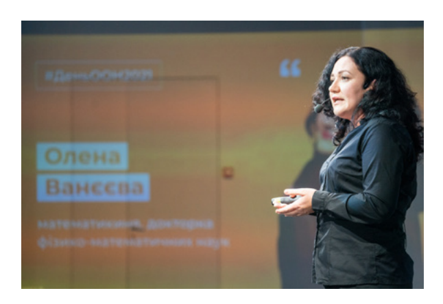
Figure 23. United Nations Day 2021

An innovative approach was applied in organizing the United Nations Day in the TED Talk format featuring 12 success stories from beneficiaries of United Nations agencies with topics varying from vaccination to gender equality and environment under the overall theme. "Recovery: becoming better through pandemic challenges". Over 4,000 people watched the broadcast, and 30,000 people were reached by Facebook. In cooperation with UNESCO Artists for Peace, a symphonic orchestra concert, as a tribute to health workers, was organized in Odessa with WHO support, officially opened by the RC.