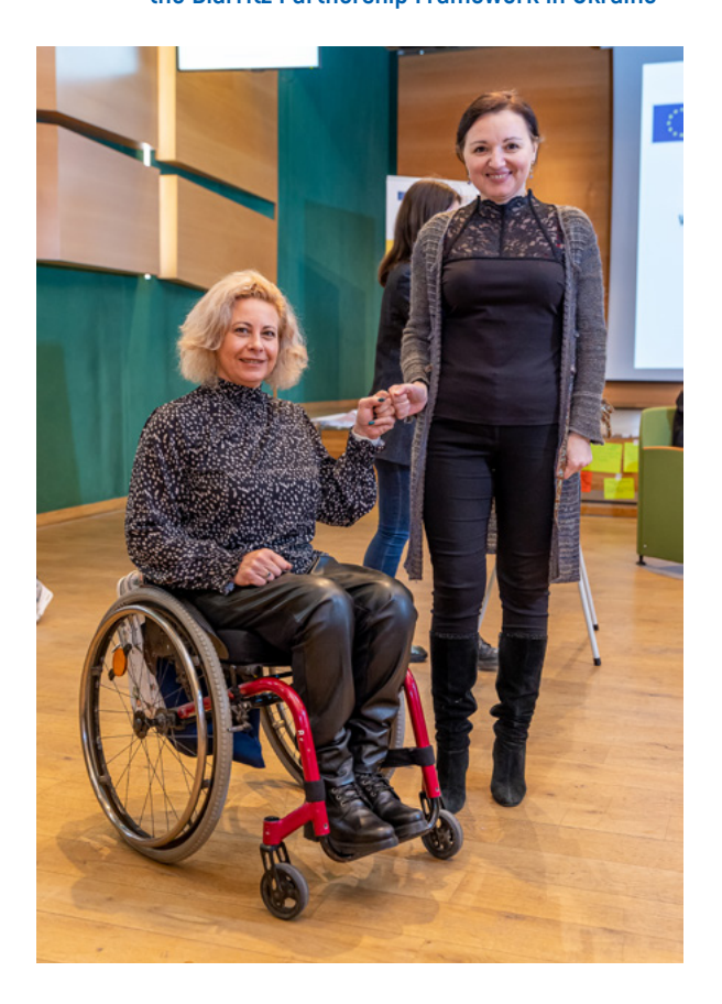
Figure 14. United Nations supported implementations of the Biarritz Partnership Framework in Ukraine

The National Agency of Civil Service (NACS) with expert support of the United Nations, amended the Code of Ethical Conduct of Civil Servants and Officials of Local Self-Governance with gender-responsive provisions to prohibit gender-based discrimination, including sexual harassment at a workplace. A new e-course on prevention and response to sexual harassment was developed and launched by the NACS and UN Women at the online learning platform of the Ukrainian School of Governance. In addition, NACS applied the training curriculum on gender-responsive human resources management, developed and piloted with UN Women support in 2020. As a result of dedicated training, 424 civil servants and local self-governance officials gained advanced skills on how to mainstream gender equality in human resources policies. This support was expanded to prioritize gender equality issues during the All-Ukrainian Youth Competition of Creative Works and also at the side event of the NACS Annual Forum, "Civil Service for New Era".