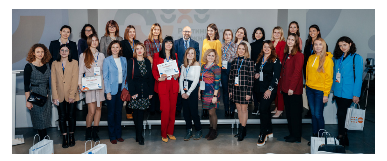
Figure 5. Pact for Youth 2025