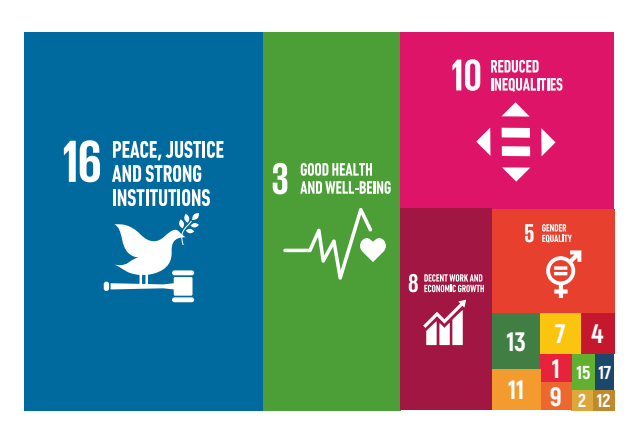
Figure 2. The United Nations contribution to the SDGs in 2021 according to UN INFO data

All United Nations interventions in 2021 were assessed and matched against the SDGs and its targets. Almost 81 percent of the US$202 million invested in 2021 is focused on driving progress towards achieving three SDGs: 40 percent is focused on SDG 16 "Peace and Justice – Strong Institutions"; 23 percent on SDG 3 "Good Health and Well-Being"; and 17 percent on SDG 10 "Reduced Inequalities".