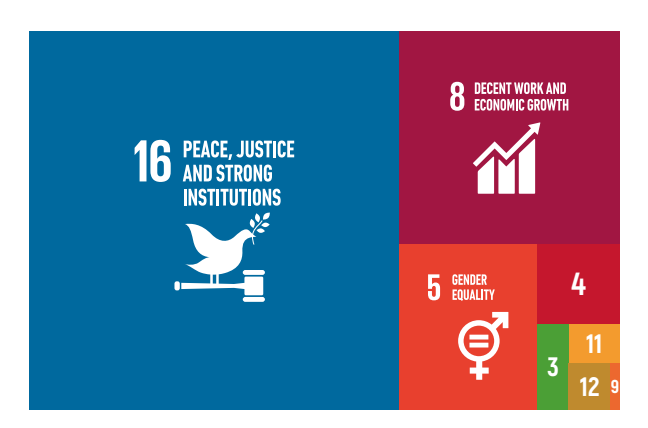
Figure 17. The proportion of the United Nations financial contribution to SDGs within the Pillar 4

AGENCIES: UNICEF, UNFPA, UNDP, OHCHR, UN WOMEN, UNOPS, UNHCR, IOM, OHCHR