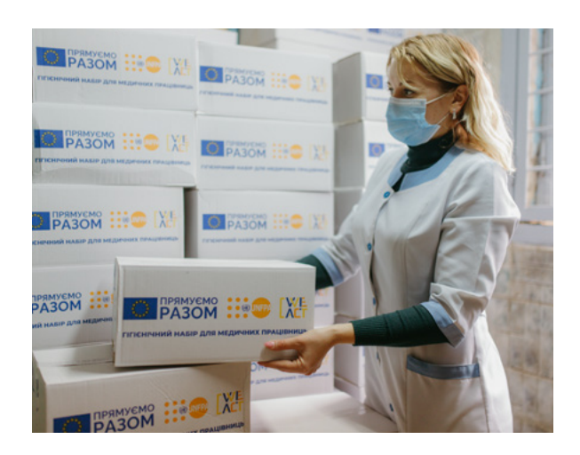
Figure 9. The United Nations in Ukraine distributed 5,000 sanitary kits to female healthcare workers working in COVID-19 designated teams in Ukraine

Several achievements were secured in tobacco control, physical activity and non-communicable disease (NCD) surveillance. In December 2021, the Parliament of Ukraine adopted the bill, 'Amendments to Certain Laws of Ukraine on the Protection of Public Health from the Harmful Effects of Tobacco'. WHO support in collaboration with civil society led to this effective advocacy action to reduce NCD risk factors in Ukraine. The new legislation is a significant step forward in the implementation the WHO Framework Convention on Tobacco Control and the approximation of the EU Tobacco Product Directive. More importantly, the new legal framework creates an effective basis to reduce smoking prevalence, protect youth from tobacco and nicotine product marketing, and impose control measures on novel tobacco products, thus improving health outcomes and saving lives.