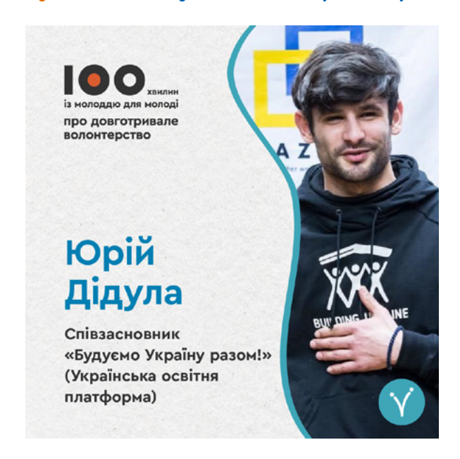
Figure 26. Online Dialogue "100 minutes for youth with youth

UNFPA and UNV jointly organized an online Dialogue, "100 minutes for youth with youth", as part of the operations of the United Nations Youth Working Group. The key topic of this thematic dialogue was long-term volunteering. Eight speakers representing the civil society, charitable, volunteer organizations and the Government discussed key challenges and opportunities for developing volunteerism in Ukraine. More than 70 participants from all over Ukraine participated in the discussion.