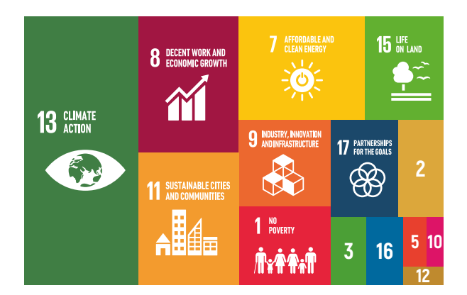
Figure 3. The proportion of the United Nations financial contribution to SDGs within Pillar 1

AGENCIES: UNDP, ILO, UNIDO, UNFPA, UNHCR, FAO, UNICEF, WHO, IOM