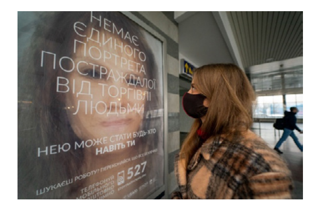
Figure 25. "Even You" counter-trafficking information campaing