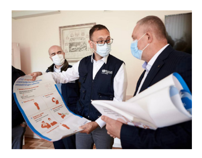
Figure 10. Efforts by the government, WHO and a wide range of health partners have substantially strengthened the response to COVID-19 in Ukraine over 2021.

WHO supported the Government of Ukraine in conducting an International Health Regulation (IHR) Joint External Evaluation (JEE), completed in December 2021. Ukraine's capabilities in 19 areas were evaluated over the course of a year through a peer-to-peer process, bringing Ukrainian experts together with members of the WHO JEE team. The technical areas covered ranged from legislative mechanisms to immunization coverage and emergency response operations. Through this process, in which the country evaluates its status together with international experts, consensus was reached on 75 priority action points.