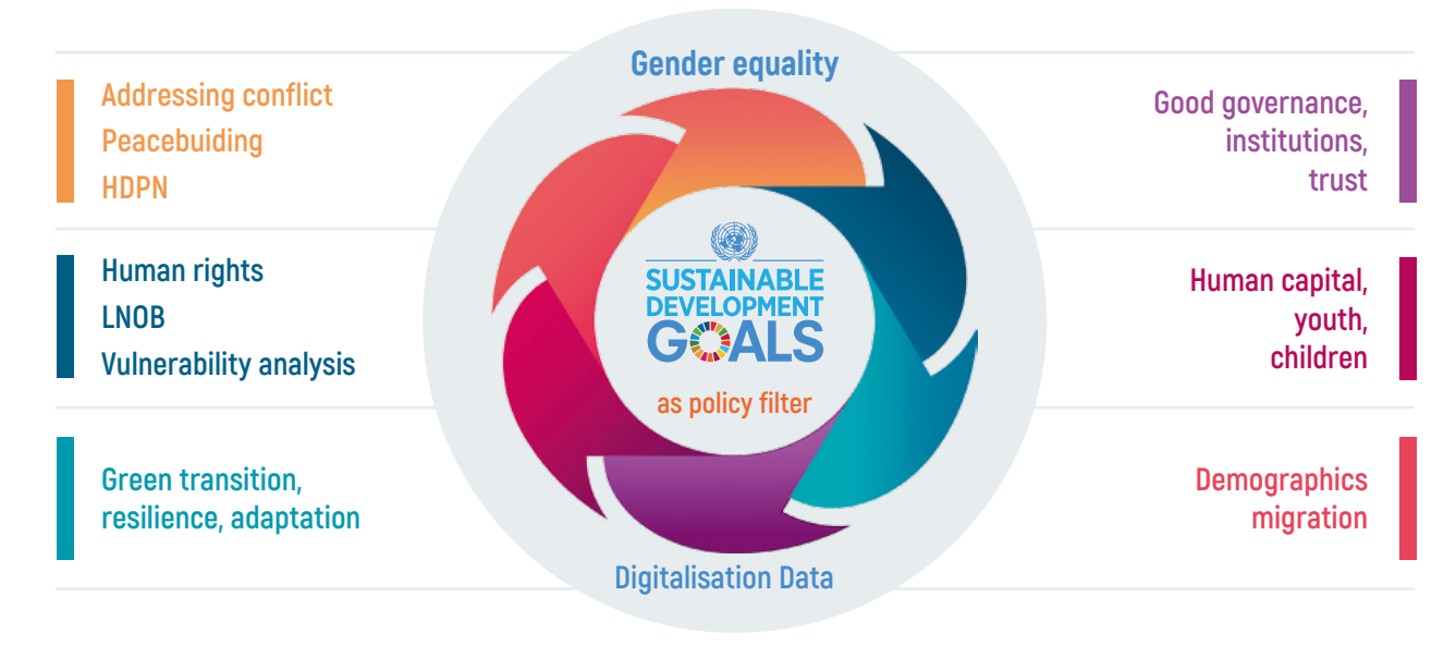
Figure 1. Key development opportunities. United Nations CCA, November 2021

In 2021, the GDP was estimated to grow by 3.4 percent (WB), with similar moderate growth rates in the next two years. Economic performance was further impacted by the COVID-19 situation, the slow increase of vaccination rates and new adaptive lockdowns since November 2021, as well as the market reaction to the military build-up and escalation near Ukrainian borders.