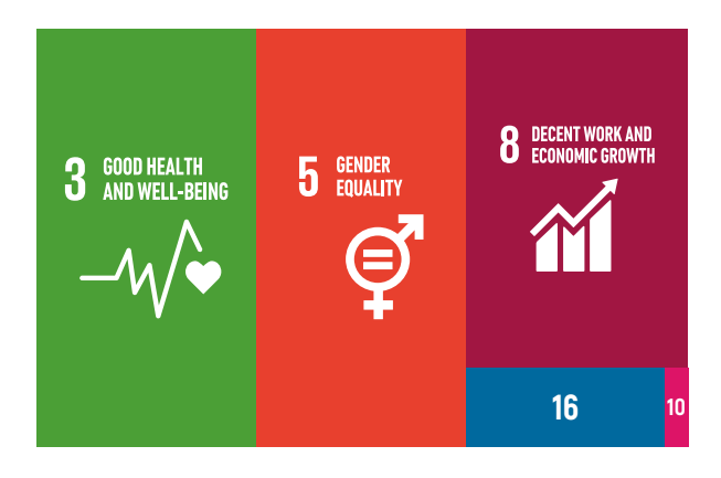
Figure 6. The proportion of the United Nations financial contribution to SDGs within Pillar 2

AGENCIES: UNICEF, UNFPA, WHO, UNDP, ILO, IOM, UNHCR, UNODC, UNAIDS, UNOPS, OHCHR