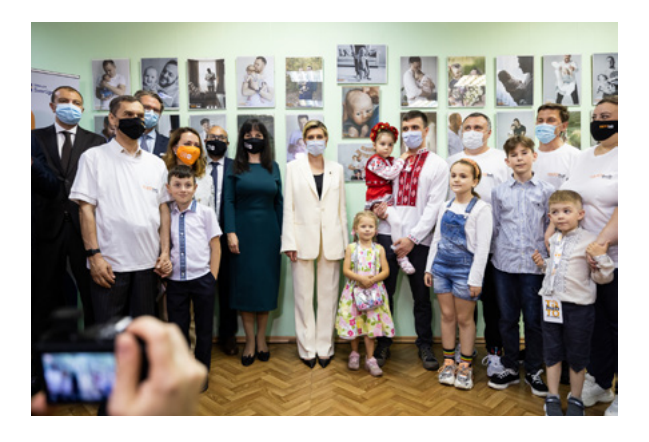
Figure 15. United Nations facilitated the establishment of five new tatohubs (dad-clubs) in Kyiv, Poltava, Zaporizhzhia, Kherson and Nova Kakhovka

Having leveraged the political commitment of communities and municipalities, UNFPA facilitated the establishment of five new tatohubs (dad-clubs) in Kyiv, Poltava, Zaporizhzhia, Kherson and Nova Kakhovka in partnership with local NGOs. Furthermore, UNFPA created a joint network of 12 new and already functioning tatohubs in Odesa, Vinnytsia, Berdiansk (Zaporizhzhia region), Troitsk and Rubizhne (Luhansk region), Kramatorsk and Myrnohrad (Donetsk region) to catalyse a shift of traditional gender stereotypes on child upbringing, partner relations, sharing of domestic chores and the prevention of domestic violence. The opening of these tatohubs was facilitated through a number of donor funded projects.