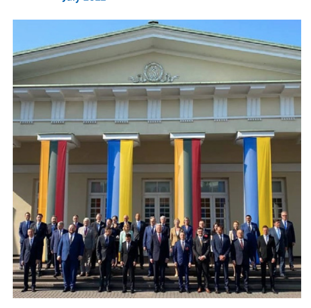
Figure 21. Ukraine Reform Conference in Vilnius, Lithuania, July 2022

Ukraine was one of the few countries presenting its investment potential at the December 2021 SDG Investment Fair in New York. The United Nations SDG Investment Fair connects investors with sustainable development projects in various countries. Participating countries use this platform to present their projects as investors scout for lucrative investment opportunities that advance the SDGs. Ukrainian state institutions together with the United Nations prepared an valuable SDG investment portfolio whose potential has attracted a great deal of attention.