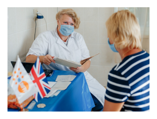
Figure 19. Two United Nations mobile clinics provided life-saving medical assistance and referral to specialised services for 8,413 people from 56 remote settlements and areas along the contact line

Two United Nations mobile clinics provided life-saving medical assistance and referral to specialized services for 8,413 people from 56 remote settlements and areas along 'the contact line', where there is no specialized healthcare assistance. Mobile clinics' specialists