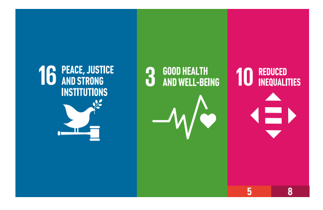
Figure 13. The proportion of the United Nations financial contribution to SDGs within the Pillar 3

AGENCIES: UNICEF, UNFPA, UNDP, ILO, UN WOMEN, UNOPS, UNHCR, IOM, OHCHR, UNV