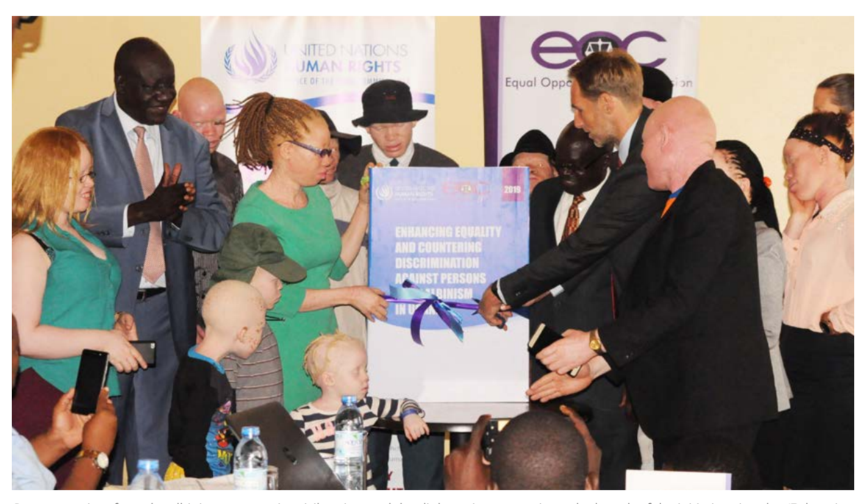
Representatives from the albinism community, civil society and the diplomatic community at the laucnh of the initiative aimed at 'Enhancing Equality and Countering Discrimination against persons with Albinism in Uganda'