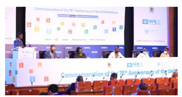
Panel Discussion on the role of Youth in accelerating the Achievement of the SDGs