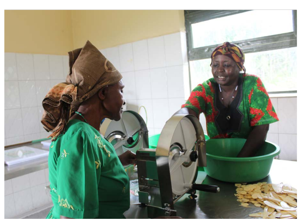
Banana processors at Rutunguru cluster farmers Association in Ntungamo district use a slicing machine donated by UNIDO to ensure high quality of banana fruits processed for the market.

Uganda is committed to enhancing partnerships with various stakeholders in accelerating the achievement of NDP III and SDG targets. Currently there are coordination platforms across numerous stakeholder mechanisms, including the National SDG Task Force, SDG Secretariat, the National Civil Society Organizations SDG Core Reference Group, Private Sector SDG Platform, Women and Gender Consortium, National Union for Persons with Disabilities and various youth umbrella organizations.