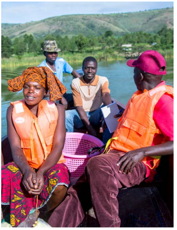
Congolese refugees sail on lake Oruchinga in western Uganda to get feed and catch white til