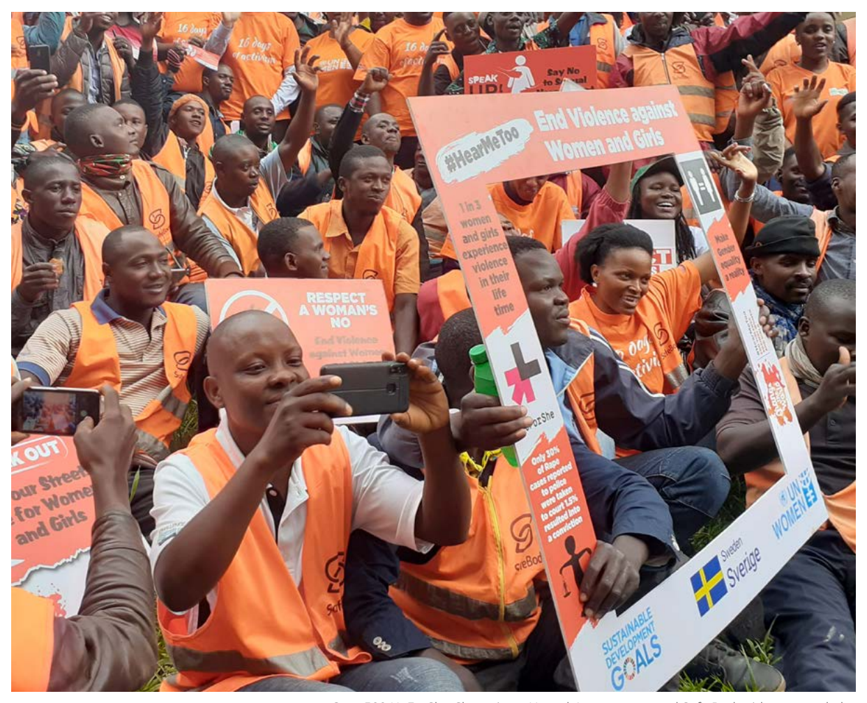
Over 500 HeForShe Champions, Uganda's motocross and Safe Boda riders to mark the 16 Days of Activism against Gender Based Violence

In this regard, the United Nations system will support the government and other non-state partners, to ensure that incidences and impact of GBV, VAW, VAC, sexual exploitation, harmful practices and abuse of women and children are substantially reduced, if not eliminated. There will be support for advocacy and sensitization to promote positive cultural and traditional practices and discard repugnant ones like female genital mutilation and child marriages; building capacities for equity responsive budgeting; and support on community mobilization and capacity building at national and local (district) levels to support mainstreaming GEWE and human rights.