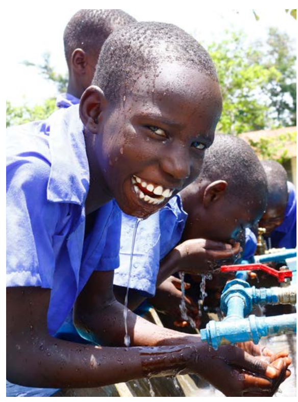
Pupils wash faces and hands at one of the water stand taps installed by UNICEF with funding from the Iceland Government on the compound Ajugopi Primary School in Adjumani District.

With the lessons learned from recent social, economic and environmental disasters, the United Nations system will work with stakeholders to strengthen national and local health, education and social protection systems for resilience and adaptation, including strengthening use of ICT and innovation to improve access to and utilization of services. In this regard, the Government and the United Nations system are committed to addressing underlying causes that hamper progress towards building strong national and local basic social and protection systems and services.