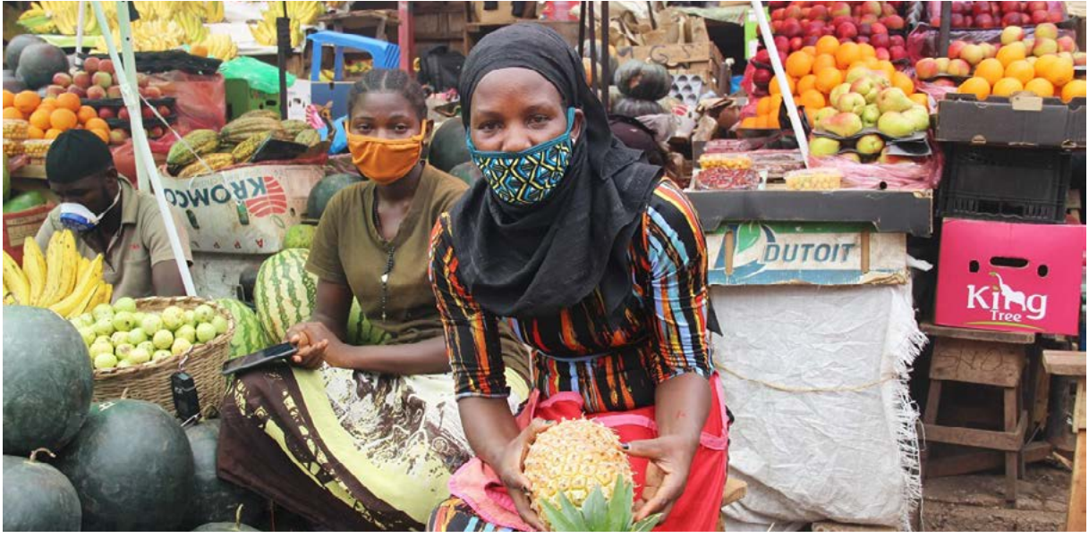
A market vendor at Nakasero market in central Kampala sells garden produce during COVID-19 pandemic

The United Nations will also ensure that the positive contributions of business operations are harnessed, while preventing potential negative impacts, such as environmental degradation, exploitation, discrimination or sexual harassment. Support will be provided through the National Action Plan on Business and Human Rights (to be adopted) and other initiatives, to ensure, among others, a decent work environment, especially for marginalized and vulnerable groups. The United Nations will foster a dynamic and well-functioning business sector, while protecting labour rights and environmental and health standards in accordance with relevant international standards and agreements and other on-going initiatives in this regard. These include the Guiding Principles on Business and Human Rights and the labour standards of the International Labour Organization, the Convention on the Rights of the Child and key multilateral environmental agreements for parties to those agreements.