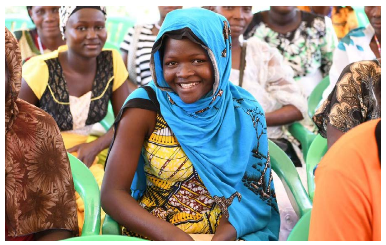
Mpara County Women's Group mobilize during the Global Spotlight Joint Monitoring Visit to Kasese