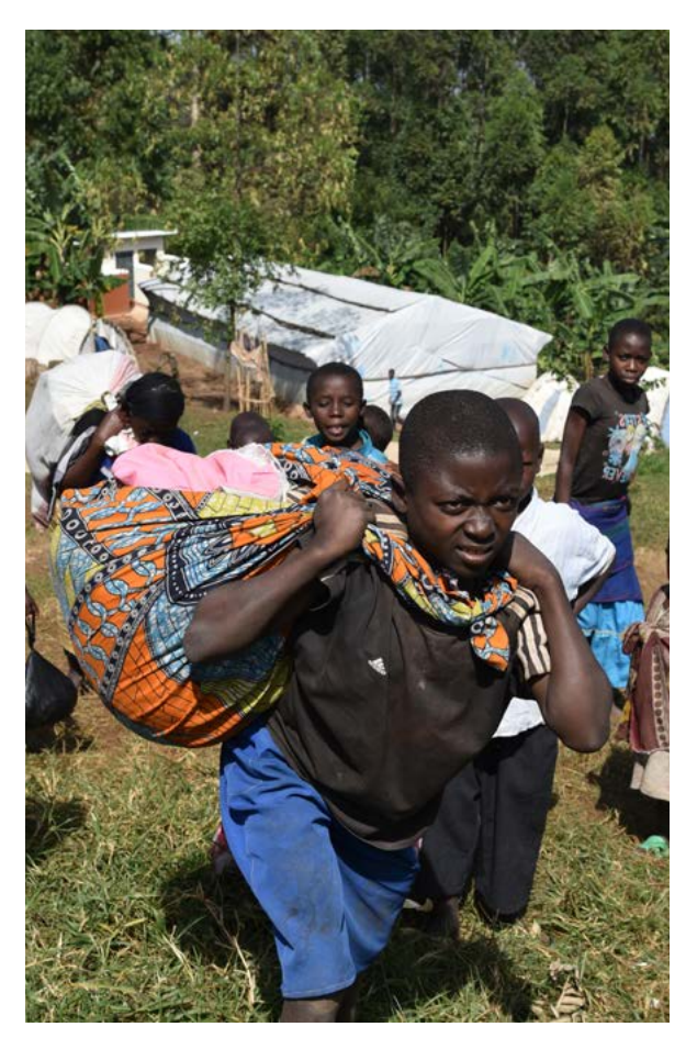
Refugees crossing into Uganda from the Democratic Republic of Congo

Uganda hosts the largest refugee population in Africa and the third largest in the world at 1.4 million refugees, and applies a progressive legal refugee framework. 94% of refugees reside in settlements in 13 refugee-hosting districts which have some of the lowest human development indices in the country. With the increased population, additional resources for service provision such as health, education and environmental conservation are needed. The Government applies the Comprehensive Refugee Response Framework (CRRF) which supports inclusion of refugees in sub-national and national development. Under the CRRF, the Government has developed comprehensive plans for education, health, water and environment and will soon finalize plans for sustainable energy, jobs and livelihoods. In light of COVID-19, livelihood and economic inclusion for refugees will be an important priority as the impacts on vulnerable people's livelihoods may be particularly severe.