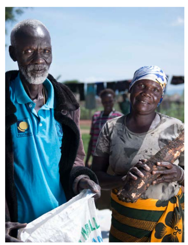
A local retailer sells food to a refugee who received cash from WFP, Adjumani Refugee Settlement

The governance structure and implementation mechanism for the Cooperation Framework will be aligned with NDP III/SDG coordination mechanisms. The CF governance structure will ensure strong national ownership and engagement. These include reconfigured Joint National UNSDCF Steering Committee as the highest governing body