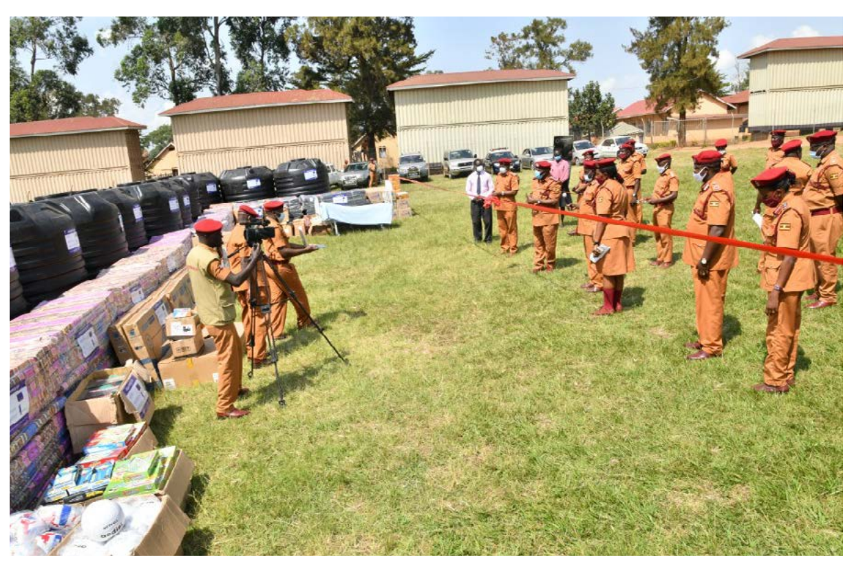
Responding to COVID 19 in Uganda's Prisons