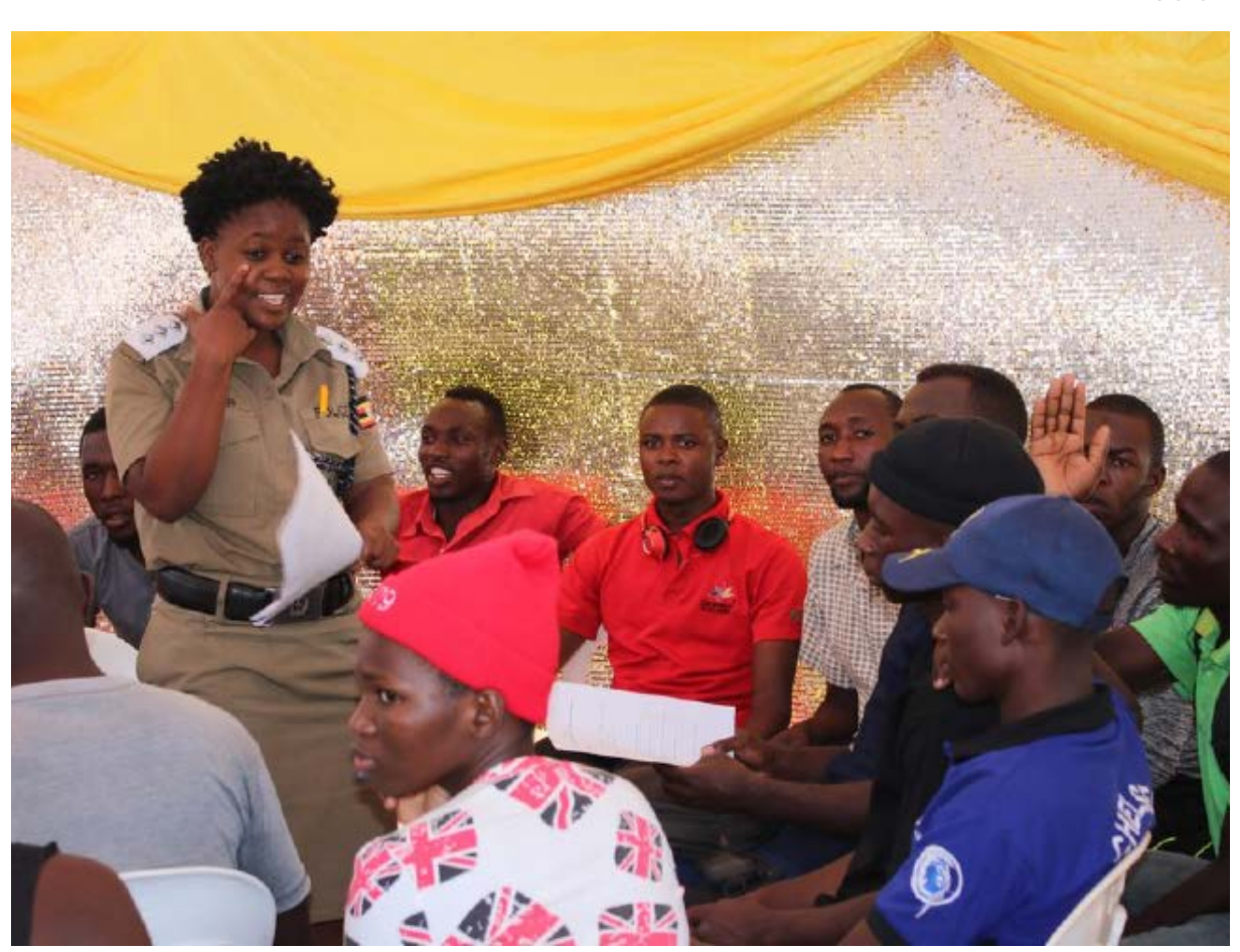
A Police officer with residents of Bwaise in Kampala, during a town hall meeting organized by IOM's EU-funded Social Cohesion project