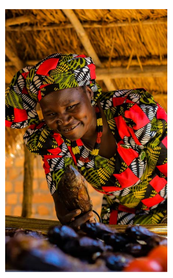
A market vendor at her makeshift stall in Yumbe district during the ground breaking for the modern market structures

Key regional frameworks including the Africa Union Agenda 2063 and the East African Community (EAC) Vision 2050 also informed the design of NDP III particularly as Uganda plays an important role in sustenance of the regional peace and security in the Great Lakes and the Horn of Africa regions.