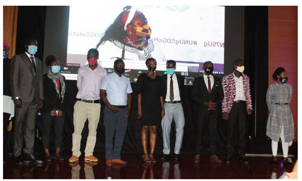
Youth Innovators winners of the One Million SDG Solutions Challenge