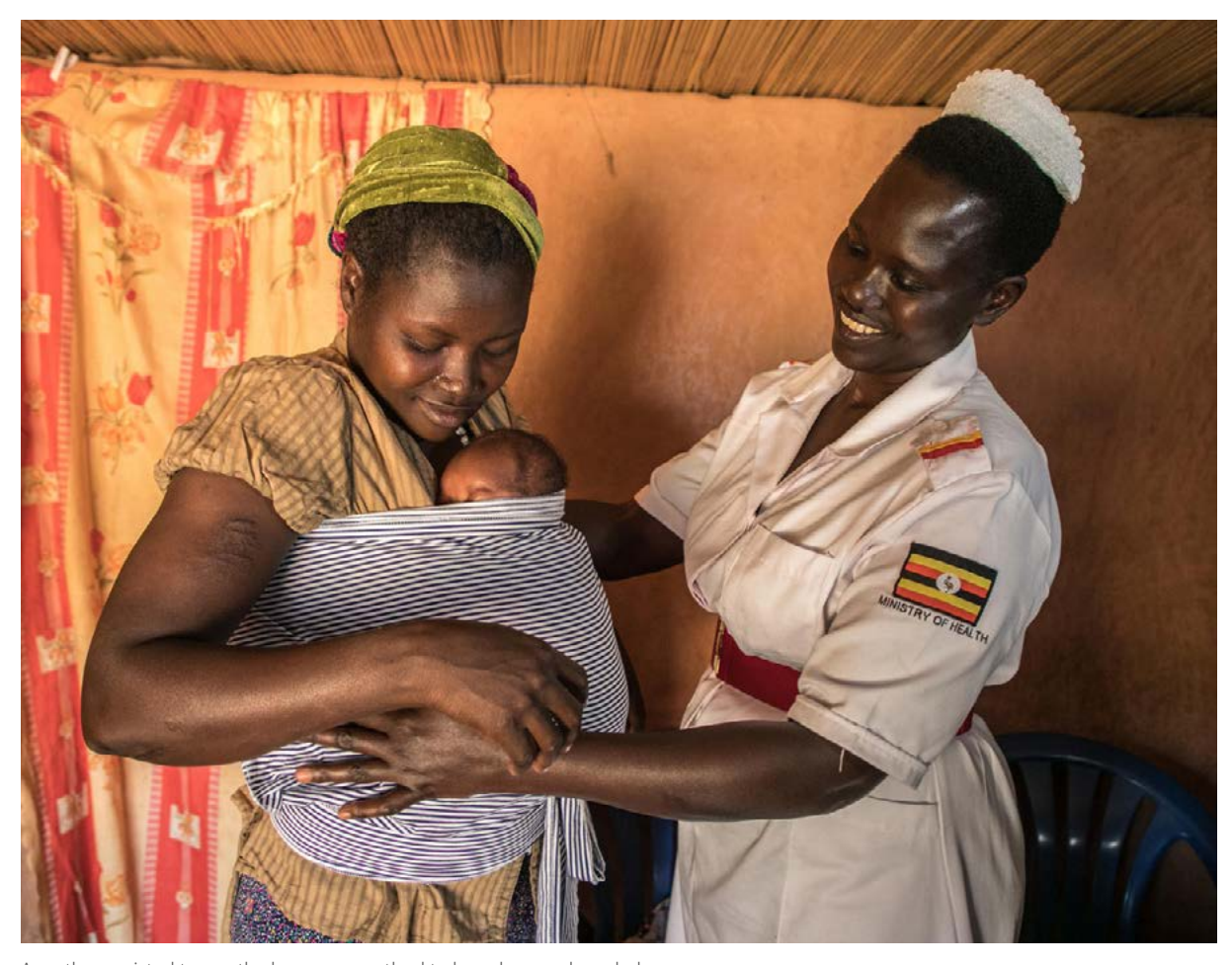
A mother assisted to use the kangaroo method to keep her newborn baby warm

Inclusive access to and utilization of quality basic and social protection services is a pre-condition and a key accelerator for transformative governance (Strategic Priority 1) and shared prosperity in a