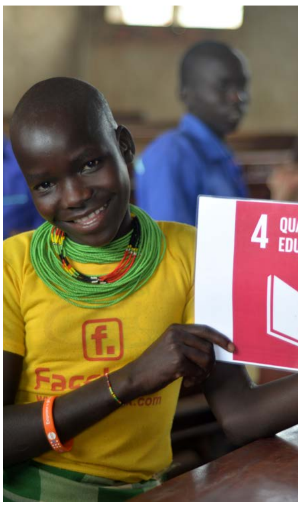
A school girl promoting SDG 4 Quality Education

Uganda's education system will be strengthened to improve equitable access, quality, efficiency and effectiveness at all levels. Specifically, improvement of access to pre-school and progression from primary one across other levels of basic education, transition from primary to secondary education, improvement in quality of education for all children at all levels, promotion of e-learning and skills development are some of the critical areas of support. The United Nations will support the Government to make schools inclusive and safe for all children, including those with special needs, and support implementation of the Education Response Plan (ERP) for refugees and host communities. The United Nations system also will work with the private sector to create opportunities for apprenticeship and innovation particularly targeting youth and women.