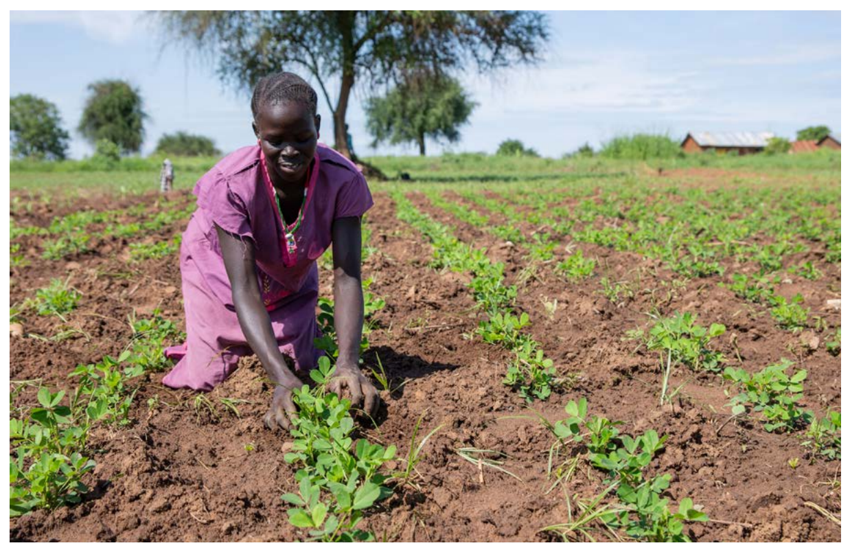
A woman tending groundnuts in a garden