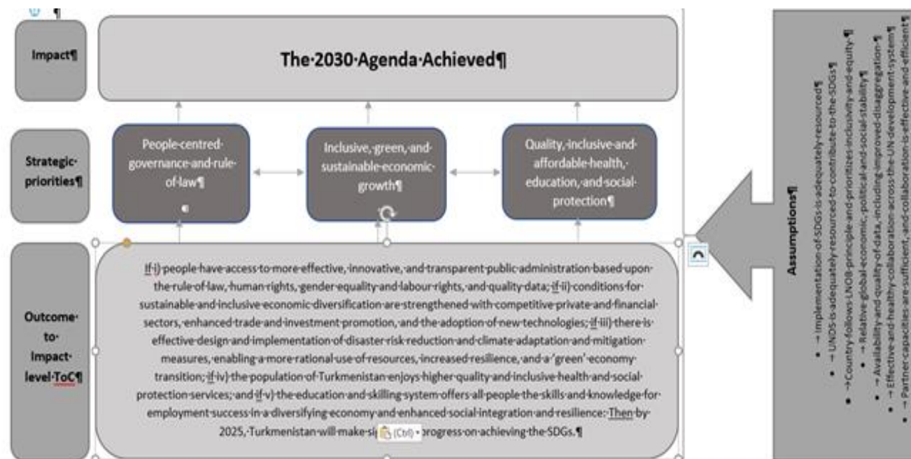
Figure 1: Cooperation Framework Theory of Change