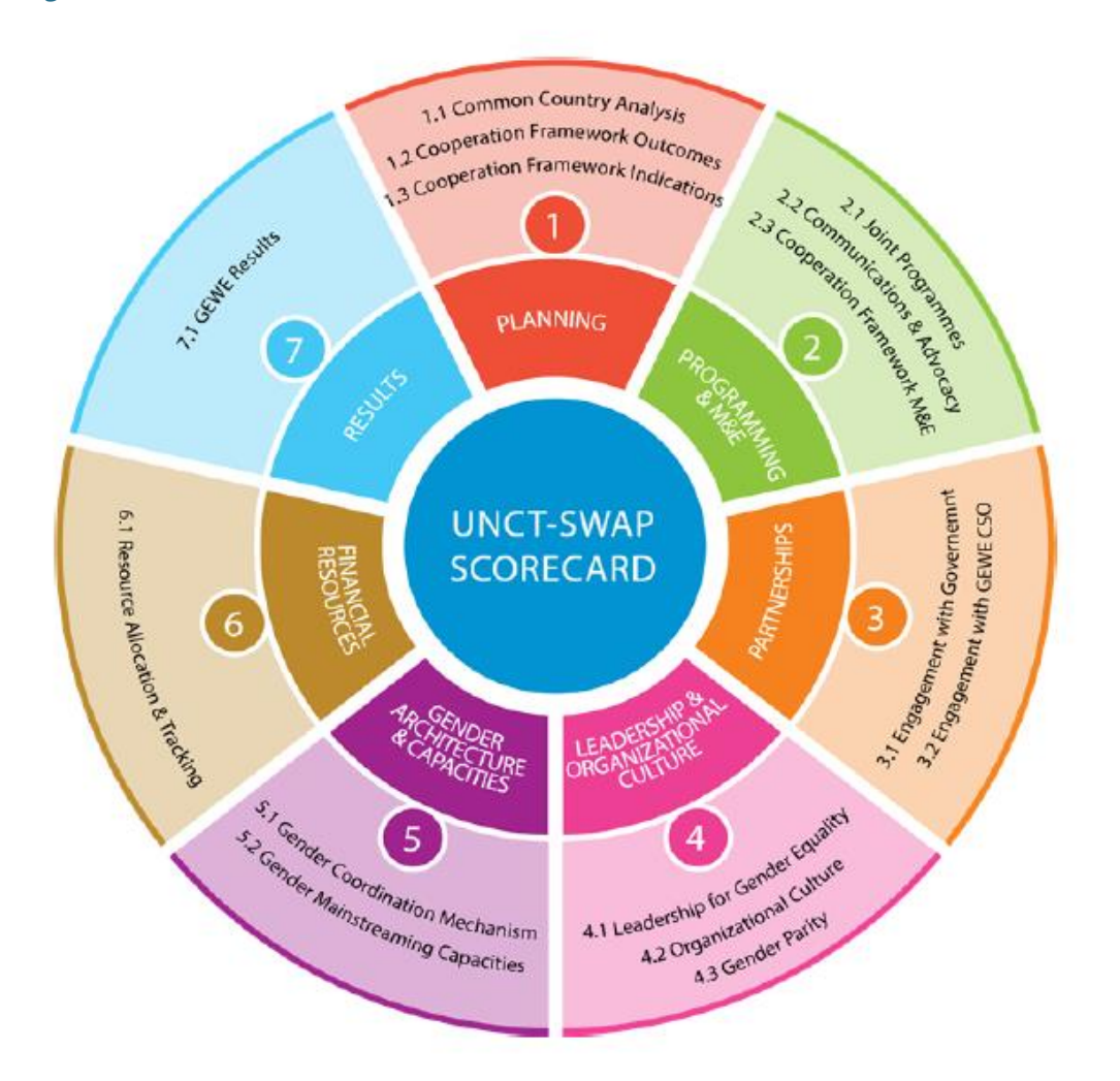
Figure 1: UNCT-SWAP Scorecard

The assessment was organized in five stages: inception, preparation of zero draft, data collection, analysis and drafting the assessment report with Action Plan and presentation, discussion and validation (Figure 2).